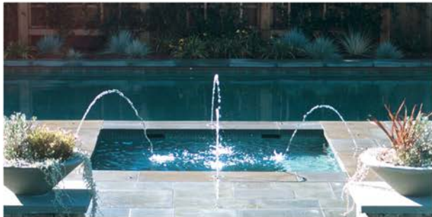
Adjusting multiple jets is a snap with the FlowControl MiniJet nozzle.